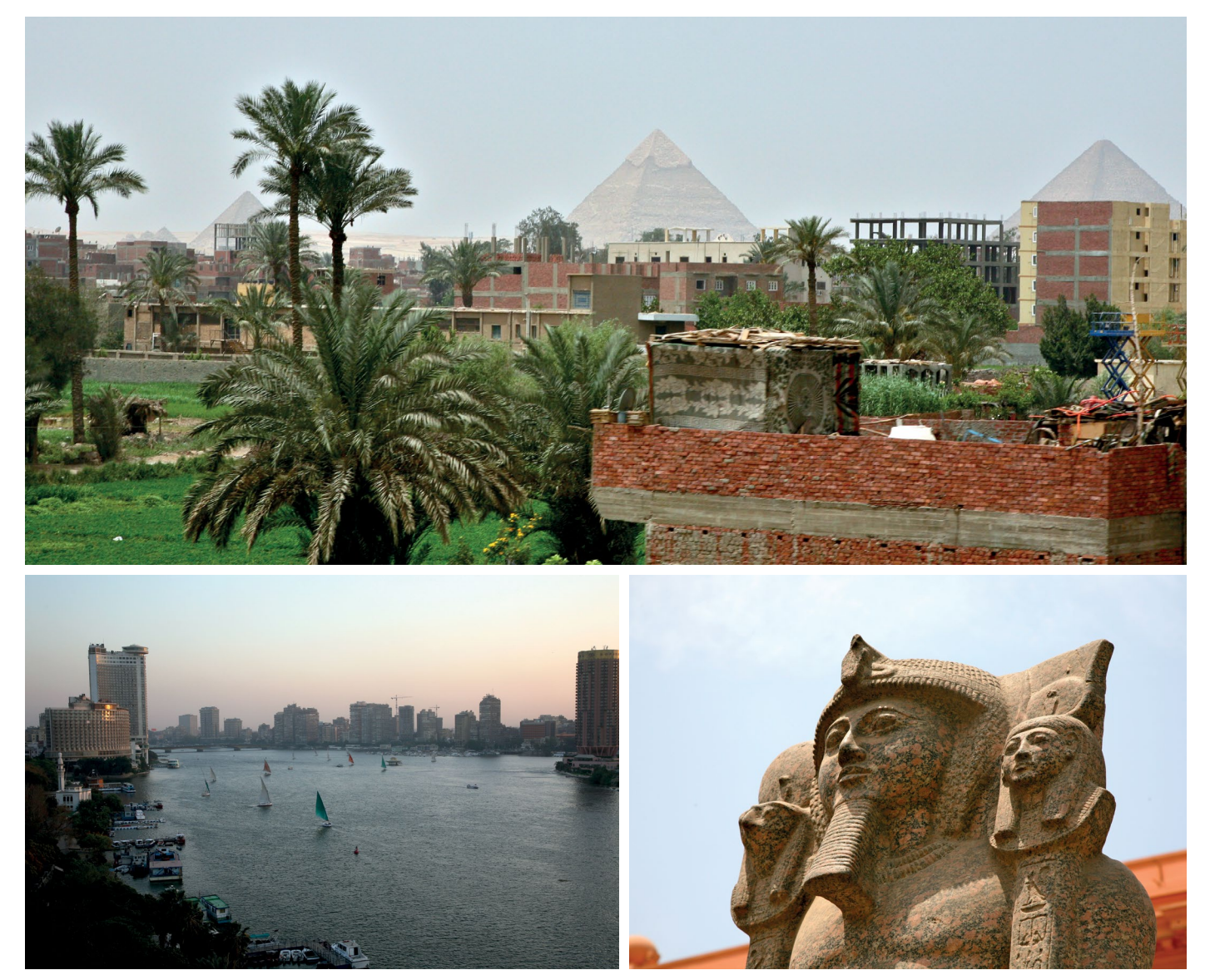
Photo above: Pyramids on the outskirts of Cairo are a familiar sight where Egyptian and Biblical history come together on the pages of the Bible. Left: The Nile is a 4,132 mile long river, considered the longest in the world. The headwaters of the Nile are located in northern Tanzania.

We ask for your intercessory prayer on behalf of the planned campaign.