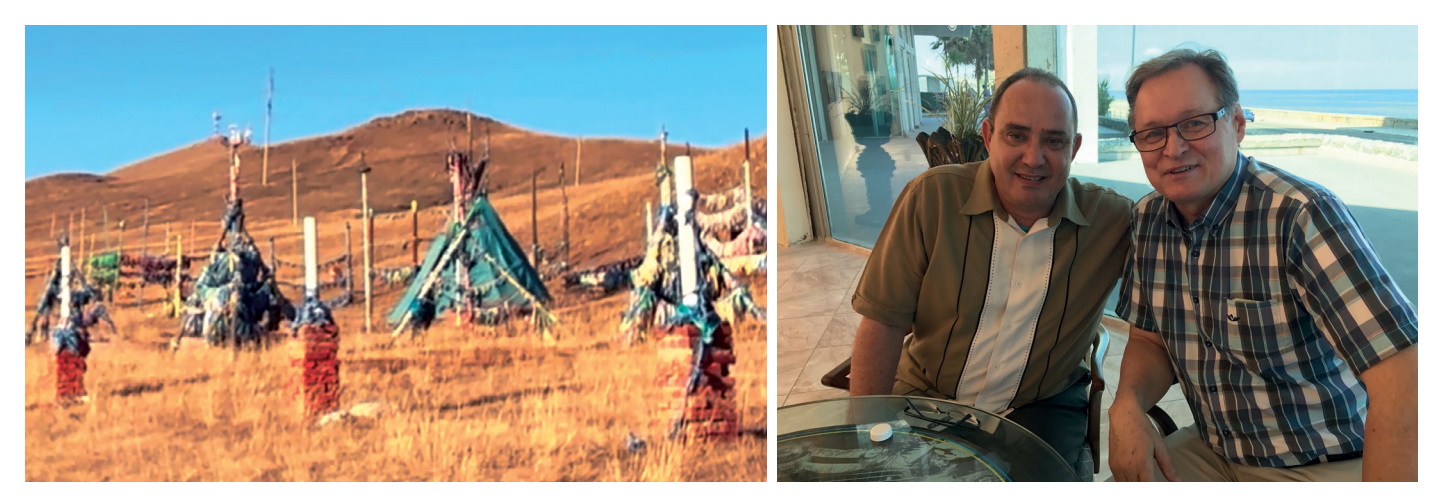
Photo Left: A shamanic place of worship in the hills of Ulaanbaatar. Many witches have come to faith during various Mega City Campaigns worldwide. Right: Our campaign director, a bishop in Cuba, told us about the conversion of Cuba's leading witch, resulting in the revival of the witches on the island.